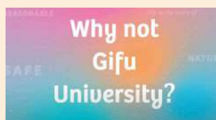
PR video for prospective students from abroad