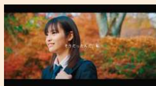
PR video for study abroad

T o help you stay connected, information on workshops, seminars, international exchange meetings, study abroad programs and scholarships are constantly updated on the university's social media (YouTube, Facebook, Instagram, etc.)