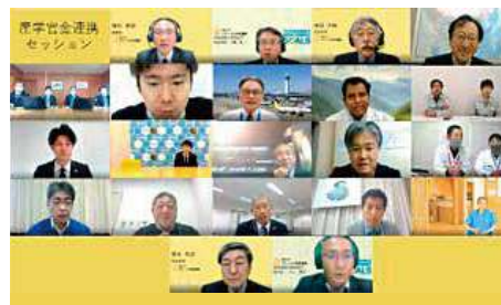
Industry-Government-Academia-Banking Institution Collaboration Session