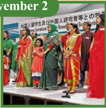
Meeting Between International Students, Researchers and Board Members Hosted by the President