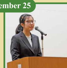
Japanese Speech Competition by International Students Residing in Gifu Prefecture