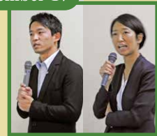
Lecture on International Student Employment Promotion Program