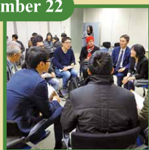
International Student Exchange Forum