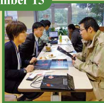
Networking with Local Companies