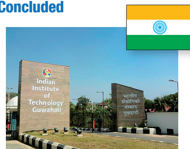
Indian Institute of Technology, Guwahati (IIT-G), India

Bioeconomy Unit, Häme University of Applied Sciences (Finland)