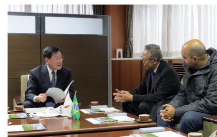
Courtesy Visit from University of Campinas, Brazil