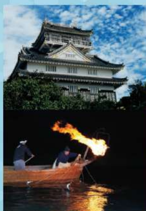
Photos from Gifu City

Gifu University is located north of Gifu City with a population of approximately 400,000. The city is rich in history and beautiful natural environment symbolized by Gifu Castle, the former residence of Oda Nobunaga, a powerful Daimyō of Japan in the late 16th century. The castle on top of Mt. Kinka looks down the Nagara River where Japan's largest fireworks display is held every summer. In addition, cormorant fishing, a traditional fishing method that uses trained cormorants to catch river fish, continues to be practiced along the river for centuries (from May to October).